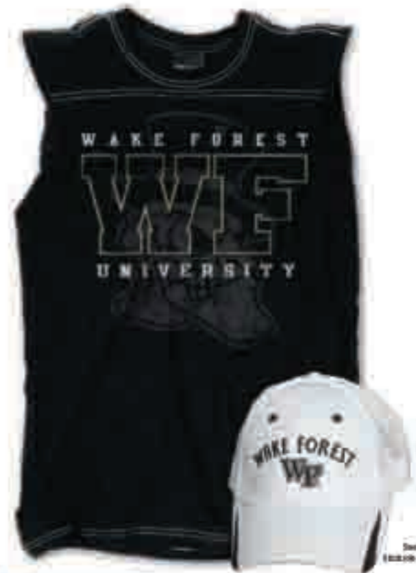
1033 CHALLENGER (S)(M)(L)(XL) DESIGN: SU 359F SHOOTER TEE, 100% COTTON JERSEY WITH FRONT AND BACK YOKE AND RAW CUT EDGE AT ARMHOLES.