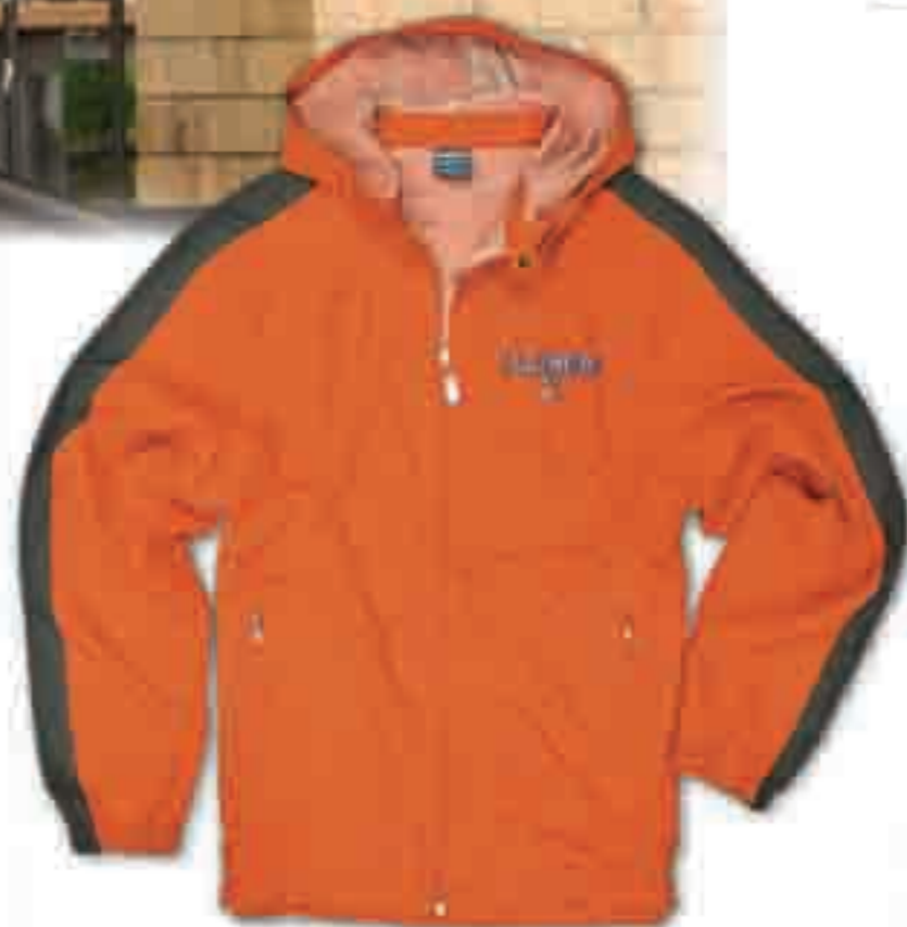
8034 SPECTATOR (S)(M)(L)(XL) DESIGN: U 301F HOODED FULL ZIP JACKET. WATER RESISTANT 100% POLYESTER WITH MESH LINING, CONTRAST SLEEVE STRIPS, FRONT ZIP POCKETS AND ELASTIC CUFFS AND BOTTOM HEAM.