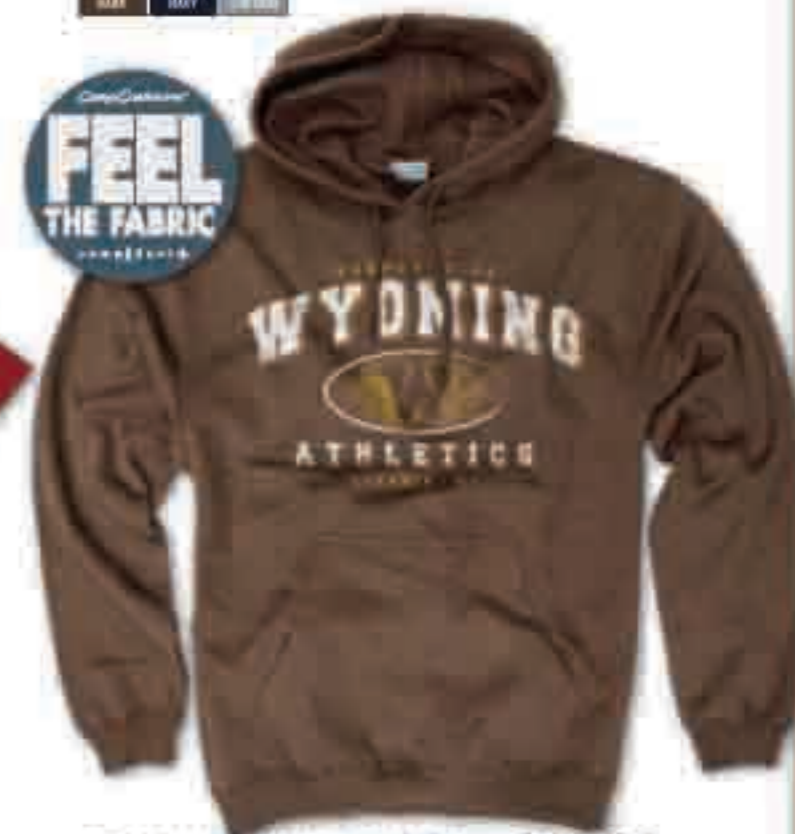
7162 CAMP CASHMERE HOOD (M)(L)(XL) DESIGN: SU 367F PULLOVER HOOD, 80% COTTON/20% POLYESTER SUEDED FLEECE WITH DRAWSTRING HOOD, TWILL NECK TAPE, FRONT PATCH POCKET AND RIB TRIM.