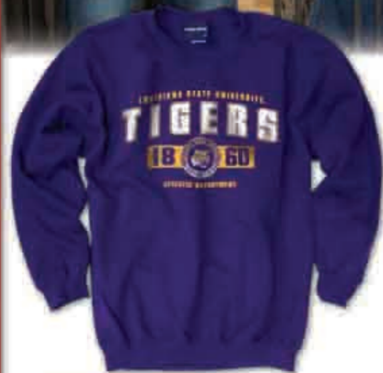
7025 CREW NECK FLEECE (S)(M)(L)(XL) DESIGN: SU 368F 50% COTTON/50% POLYESTER ATHLETIC BLEND FLEECE WITH RIB TRIM.