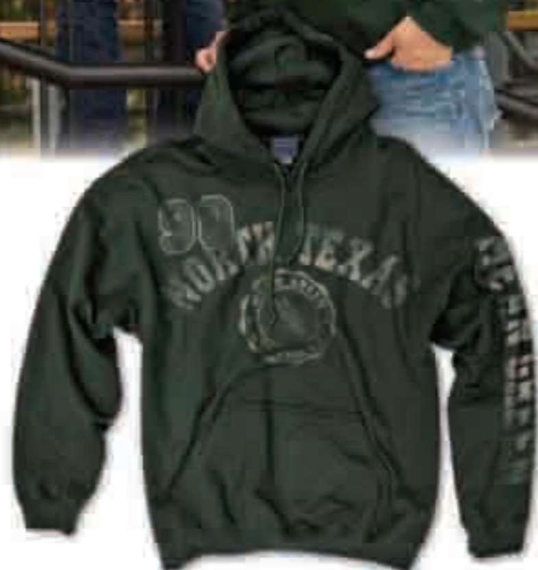
7026 HOODED FLEECE (S)(M)(L)(XL) DESIGN: SU 847F & SU 1221F 50% COTTON/50% POLYESTER ATHLETIC BLEND FLEECE WITH PATCH POCKET, DRAWSTRING HOOD AND RIB TRIM.