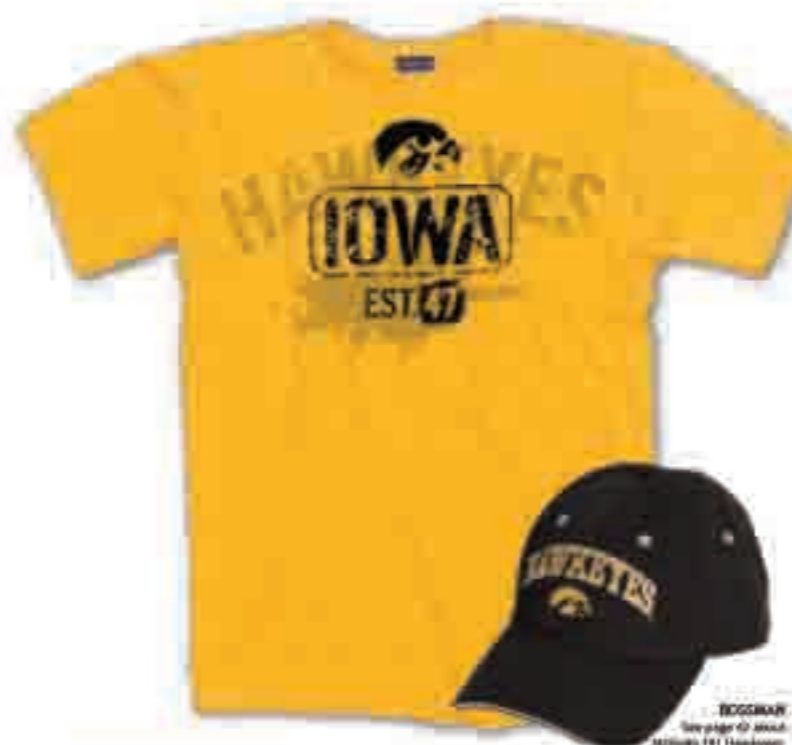
1020 BASIC TEE (S)(M)(L)(XL) DESIGN: SU 305F 100% COTTON JERSEY TEE WITH RIB NECK AND TWO-NEEDLE FINISH AT HEMS.