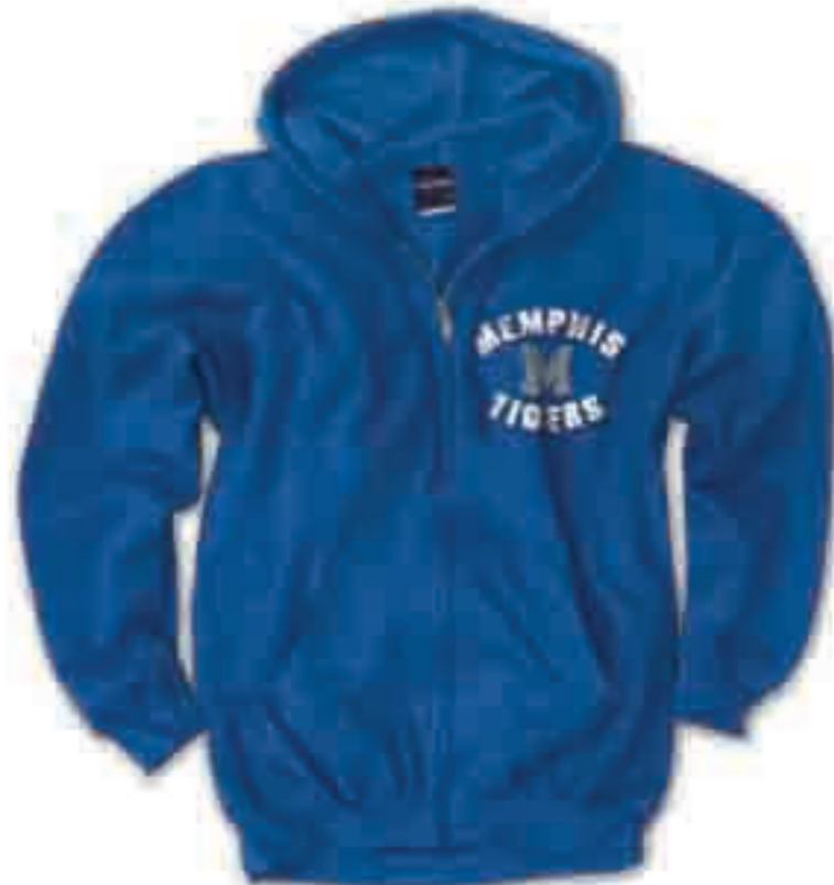
7027 FULL-ZIP HOOD (S)(M)(L)(XL) DESIGN: U 2920A 50% COTTON/50% POLYESTER ATHLETIC BLEND FLEECE WITH FRONT PATCH POCKET, DRAWSTRING HOOD AND RIB TRIM.