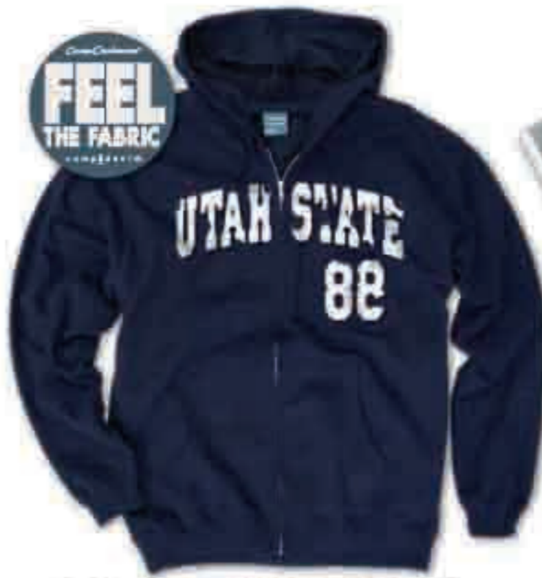
7163 CAMP CASHMERE ZIP HOOD (M)(L)(XL) DESIGN: I 1459DL FULL ZIP HOOD, 80% COTTON/20% POLYESTER SUEDED FLEECE WITH DRAWSTRING HOOD, TWILL NECK TAPE, FRONT PATCH POCKET AND RIB TRIM.