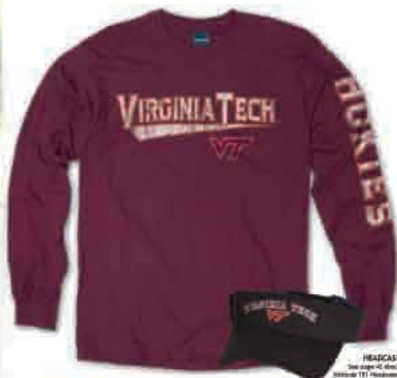
4012 LONG SLEEVE TEE (S)(M)(L)(XL) DESIGN: SU 309F & SU 1730S 100% COTTON CREW NECK WITH RIB TRIM AND TWO-NEEDLE FINISH AT HEMS.