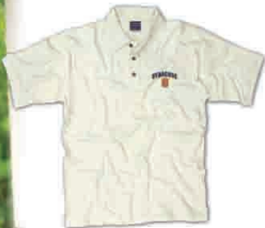
2040 HERITAGE (S)(M)(L)(XL) DESIGN: U 2949 CAMP PIQUE POLO, 100% COTTON LIGHTWEIGHT BABY PIQUE WITH THREE-BUTTON PLACKET, SINGLE RAISED OTTOMAN COLLAR, AND SIDE VENTS.