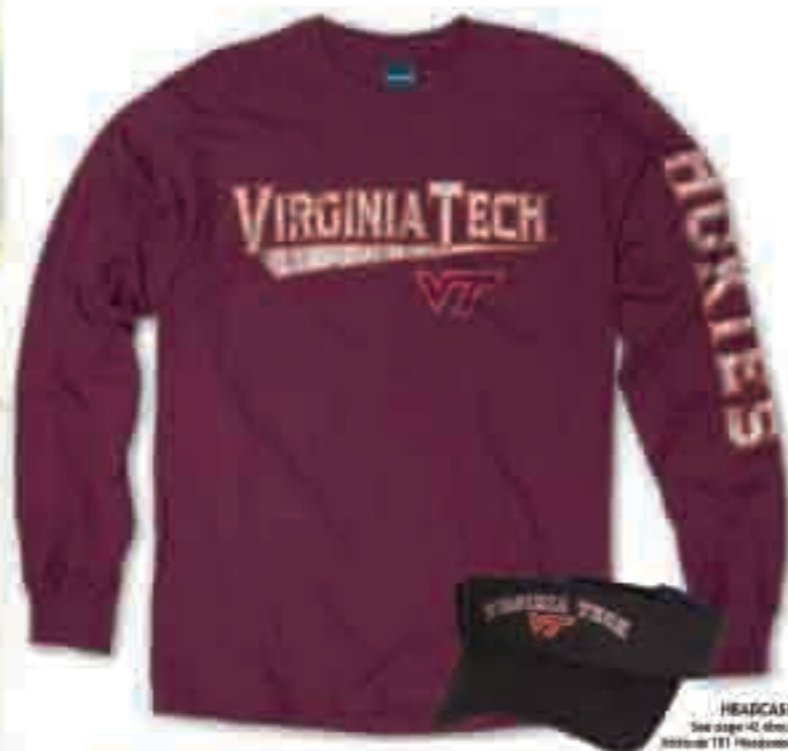
4012 LONG SLEEVE TEE (S)(M)(L)(XL) DESIGN: U1 309F B1 17305 100% COTTON CREW NECK WITH RIB TRIM AND TWO-NEEDLE FINISH AT HEMS.