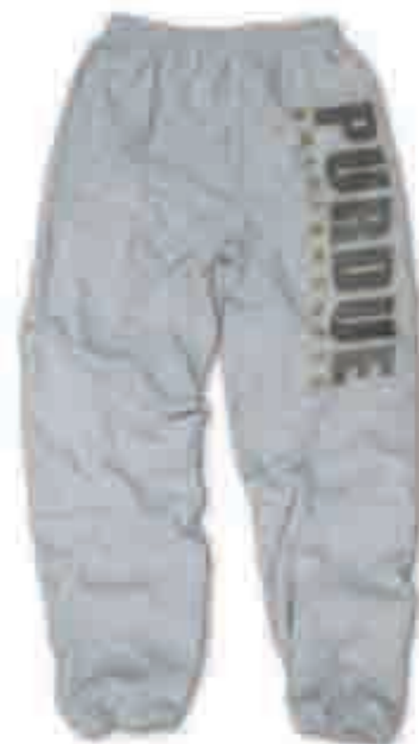
5026 FLEECE PANT (S)(M)(L)(XL) DESIGN: SI 1237LH 50% COTTON/50% POLYESTER ATHLETIC BLEND FLEECE WITH ELASTIC WAISTBAND AND CUFFS.