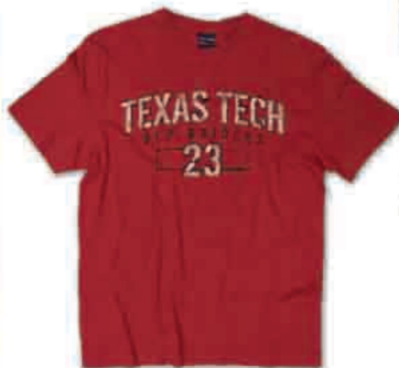
1039 GAME TEE (M)(L)(XL) DESIGN: II 1228F ATHLETIC FIT TEE, 100% COTTON STRETCH JERSEY WITH RIB NECK AND TWO-NEEDLE FINISH AT HEMS.