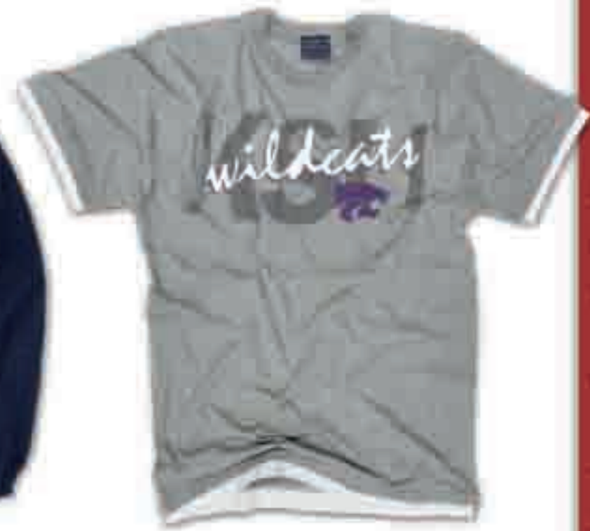
1059 UNDERTOW (M)(L)(XL) DESIGN: SU 371F GARMENT WASHED TEE, 100% COTTON STRETCH JERSEY WITH CONTRAST DOUBLE FABRIC AT CUFFS AND BOTTOM HEM.