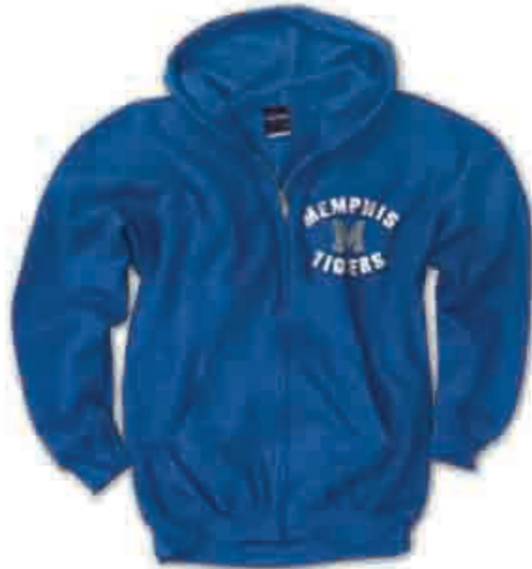
7027 FULL-ZIP HOOD (S)(M)(L)(XL) DESIGN: U1 29208 50% COTTON/50% POLYESTER ATHLETIC BLEND FLEECE WITH FRONT PATCH POCKET, DRAWSTRING HOOD AND RIB TRIM.