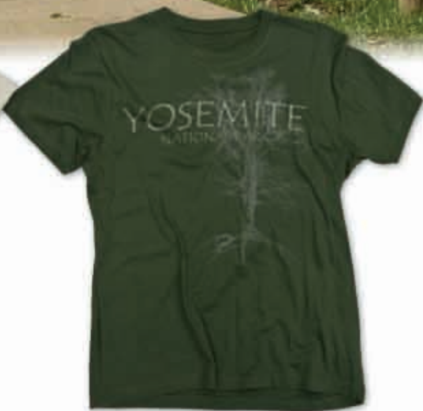
1080 ORGANIC MEN'S TEE (S)(M)(L)(XL)(XXL) DESIGN: SC 1927 CAMP ORGANIC TEE, 100% ORGANIC COTTON WITH SELF FABRIC NECK TRIM AND 2-NEEDLE HEMS.