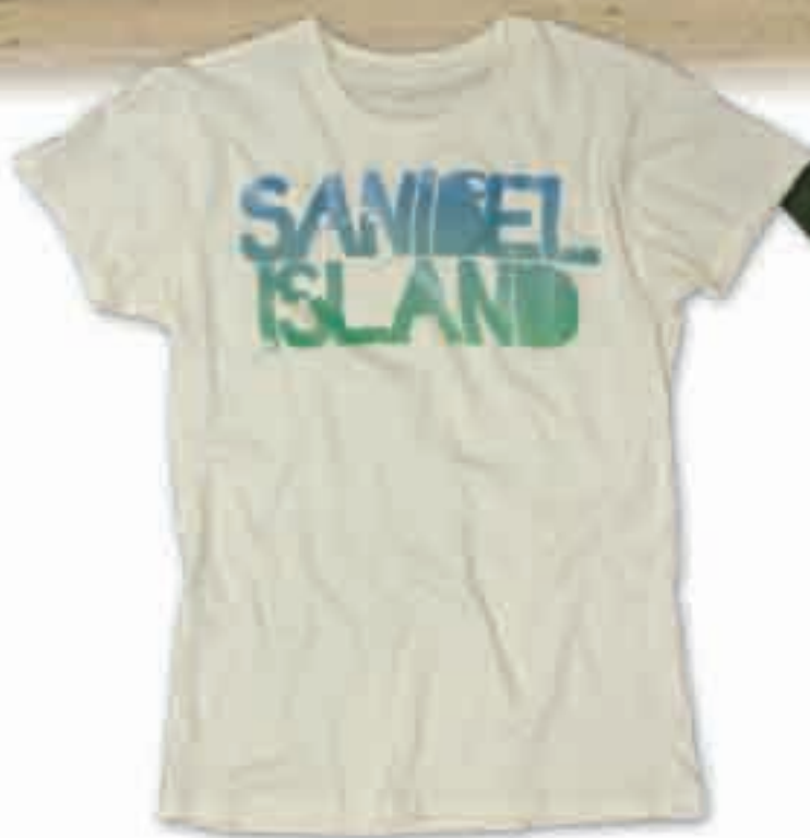
108 WOMEN'S ORGANIC TEE (S)(M)(L)(XL)(XXL) DESIGN: SW 937 CAMP ORGANIC TEE, 100% ORGANIC COTTON WITH SELF FABRIC NECK TRIM AND 2-NEEDLE HEMS.